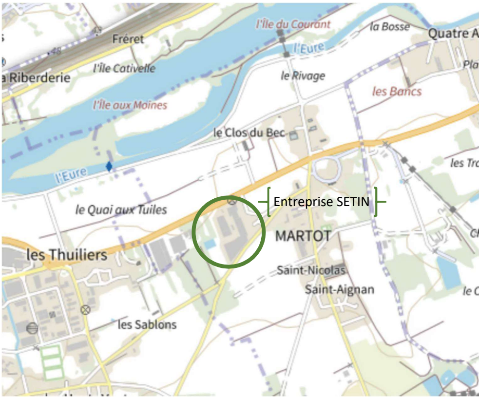
Echelle : 1/28 600